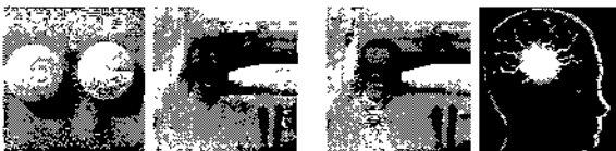
Generic Aricept News and Pricing The Combination of Aricept and Namenda Helps Sl... Mentally Stimulating Activities May Decrease th... Alzheimer's Disease Facts and Figures 2008